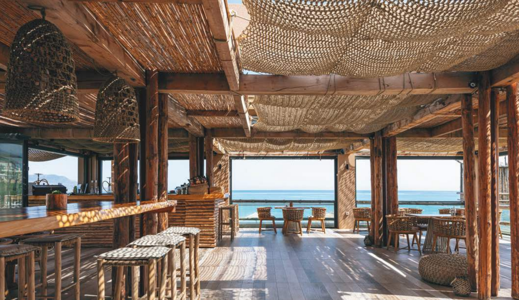
Eating & Drinking